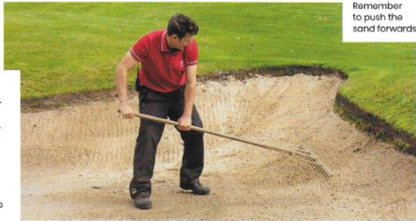
Remember to push the sand forwards

1 Basically you're trying to get the sand as level as possible so it's fair for the next golfer who visits that bunker. What you must remember to do is to push the sand forward with the rake. Nine times out of ten when a golfer comes out of a bunker, he or she will rake the sand backwards toward the rear, causing the majority of the sand to build up at the back edge of the bunker, which is what you don't want.