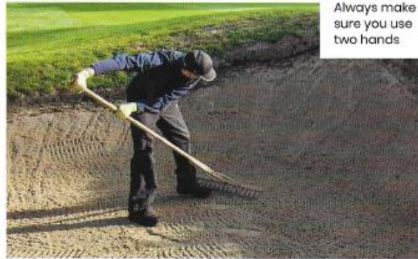
Always make sure you use two hands

2 The other thing golfers tend to do is use one hand on the rake, perhaps with their club still in their other hand, and drag the sand out towards the back of the bunker. Far better to use two hands and again, remember to push the sand forwards, not just backwards.