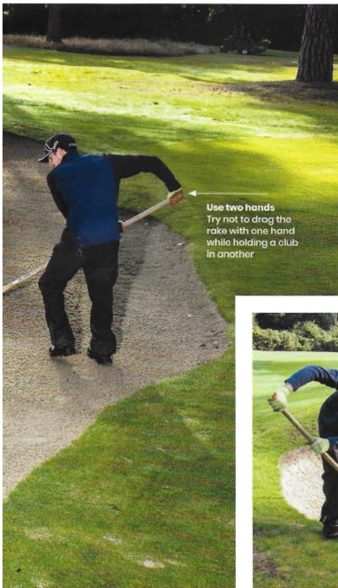
Use two hands Try not to drag the rake with one hand while holding a club in another

2 The other thing golfers tend to do is use one hand on the rake, perhaps with their club still in their other hand, and drag the sand out towards the back of the bunker. Far better to use two hands and again, remember to push the sand forwards, not just backwards.